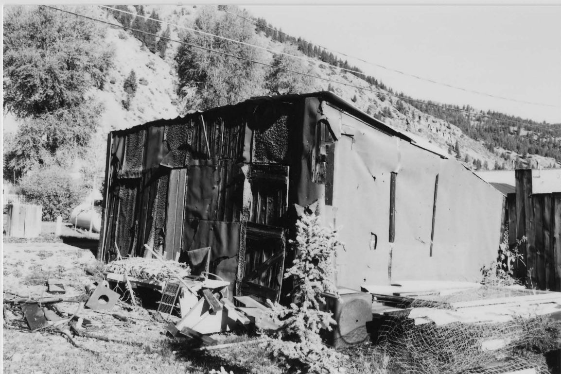
5HN.68.209 Shed 1 9/2002