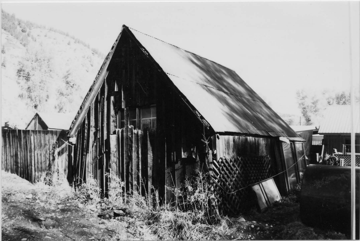
5HN.68.209 Shed 2 9/2002