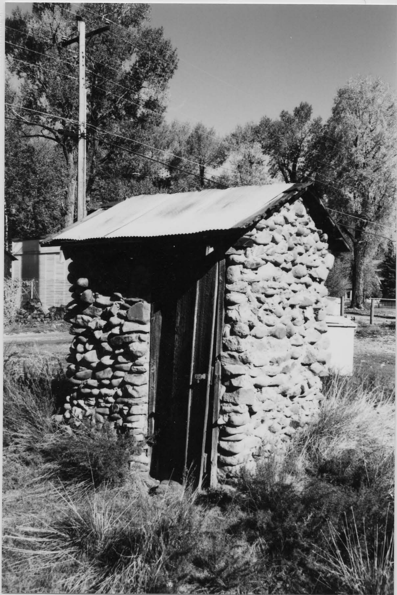
5HN.68.221 Privy 9/2002