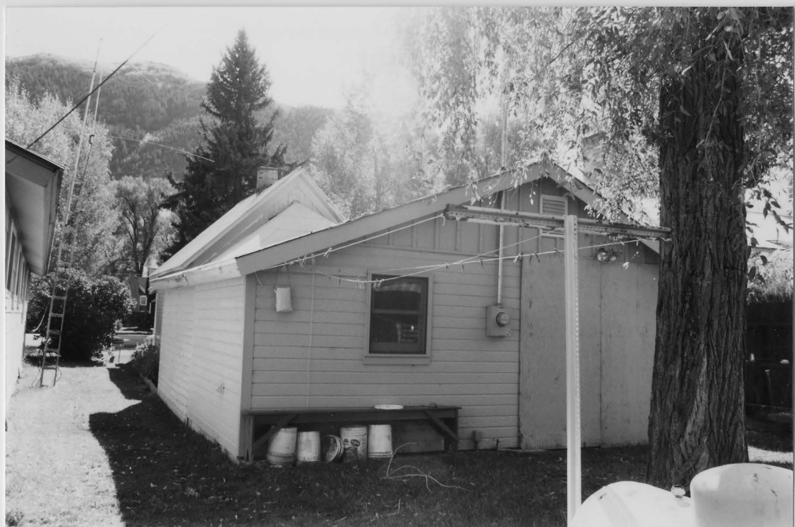
5HN.68.123 House 9/2002