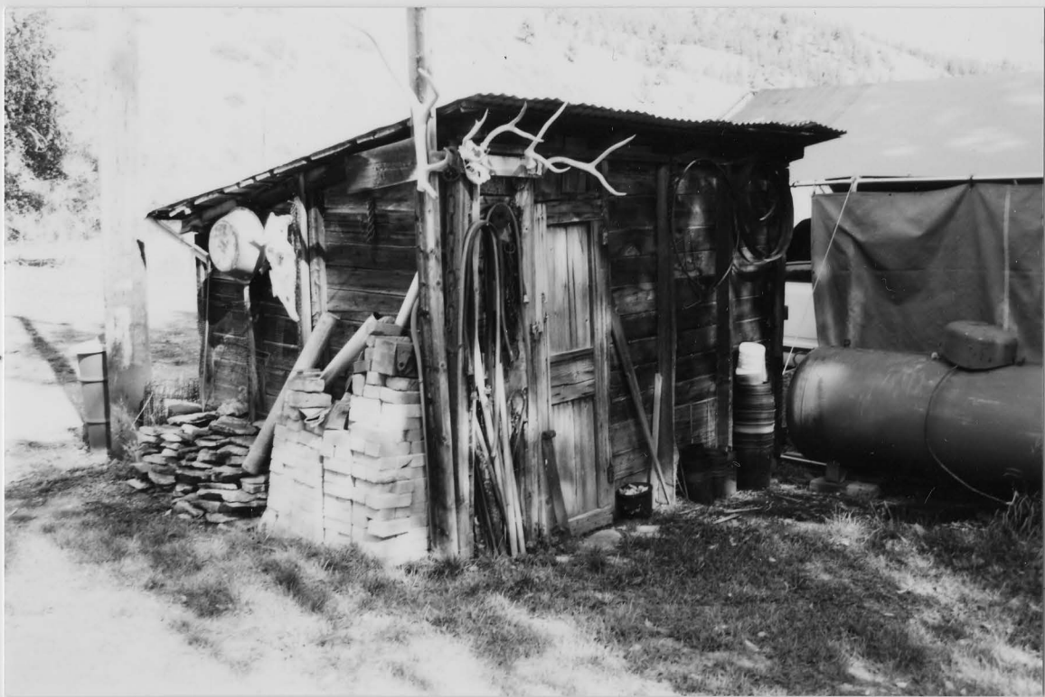
5HN.68.123 Shed 9/2002