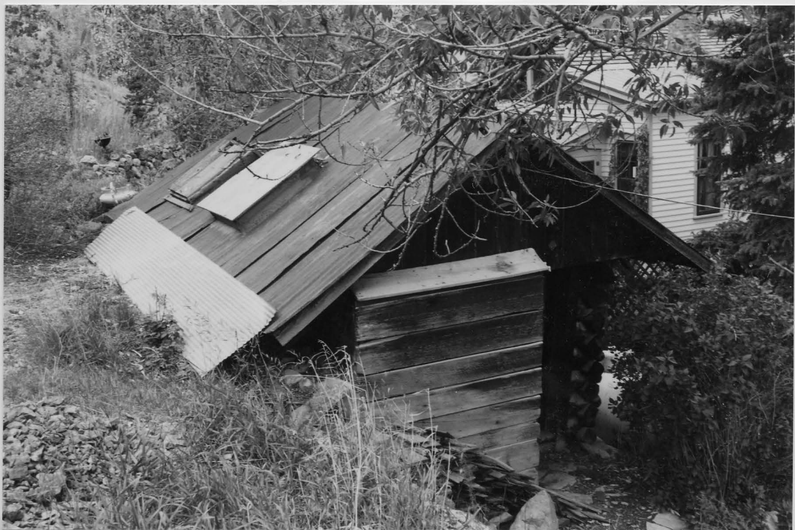
5HN.68.8 Coal Shed 9/2002