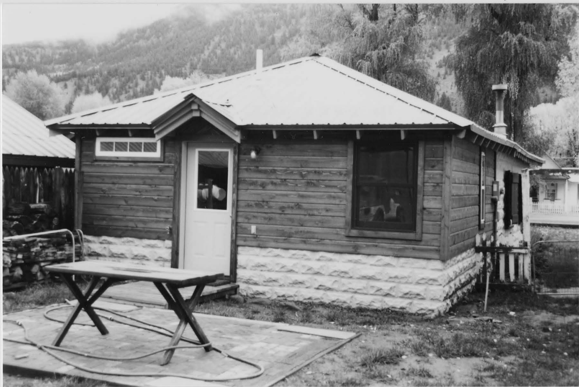
5HN.68.159 Addition 9/2002