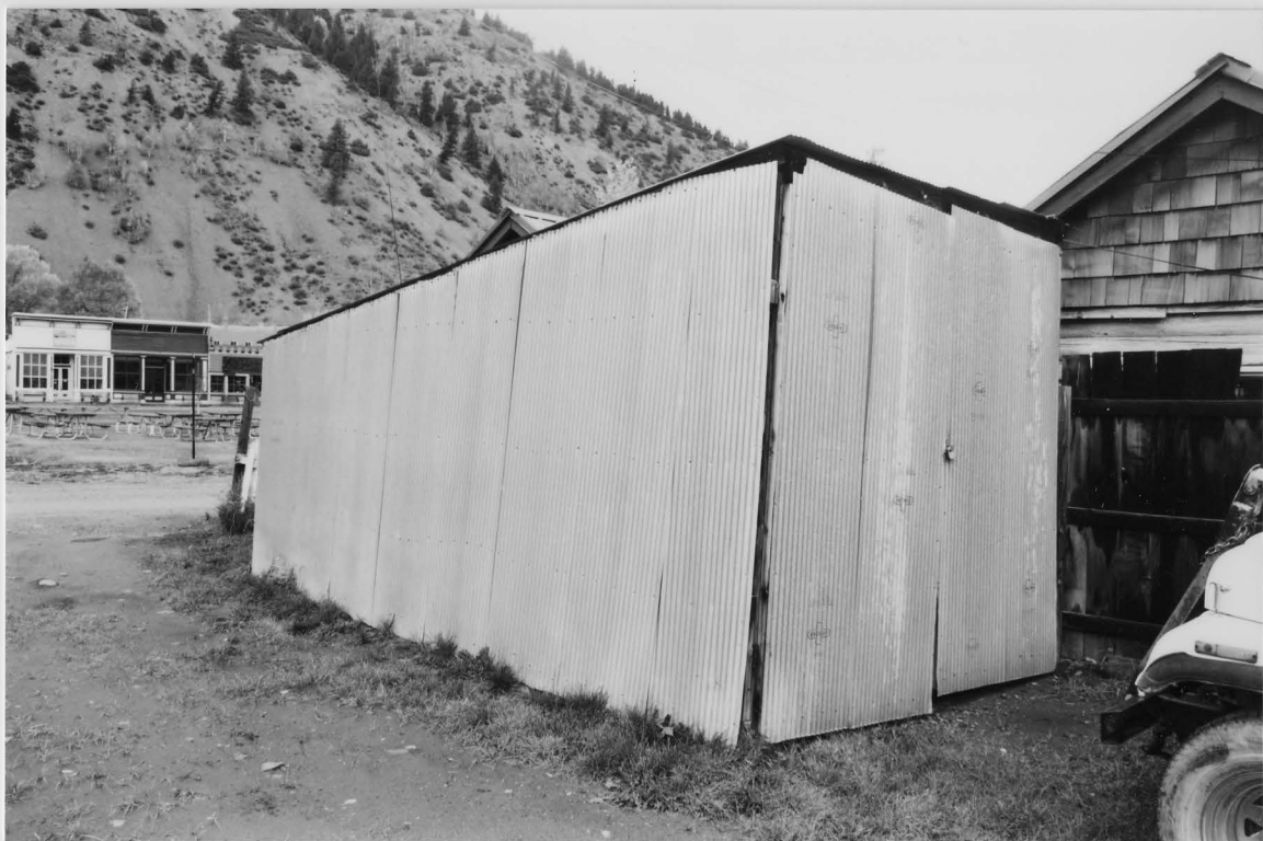
5HN.68.159 Shed 9/2002