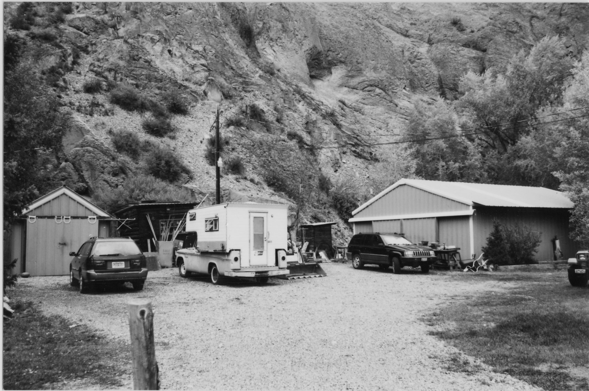
5HN.68.53 Shed 1, Shed 2, Privy, Garage 9/2002