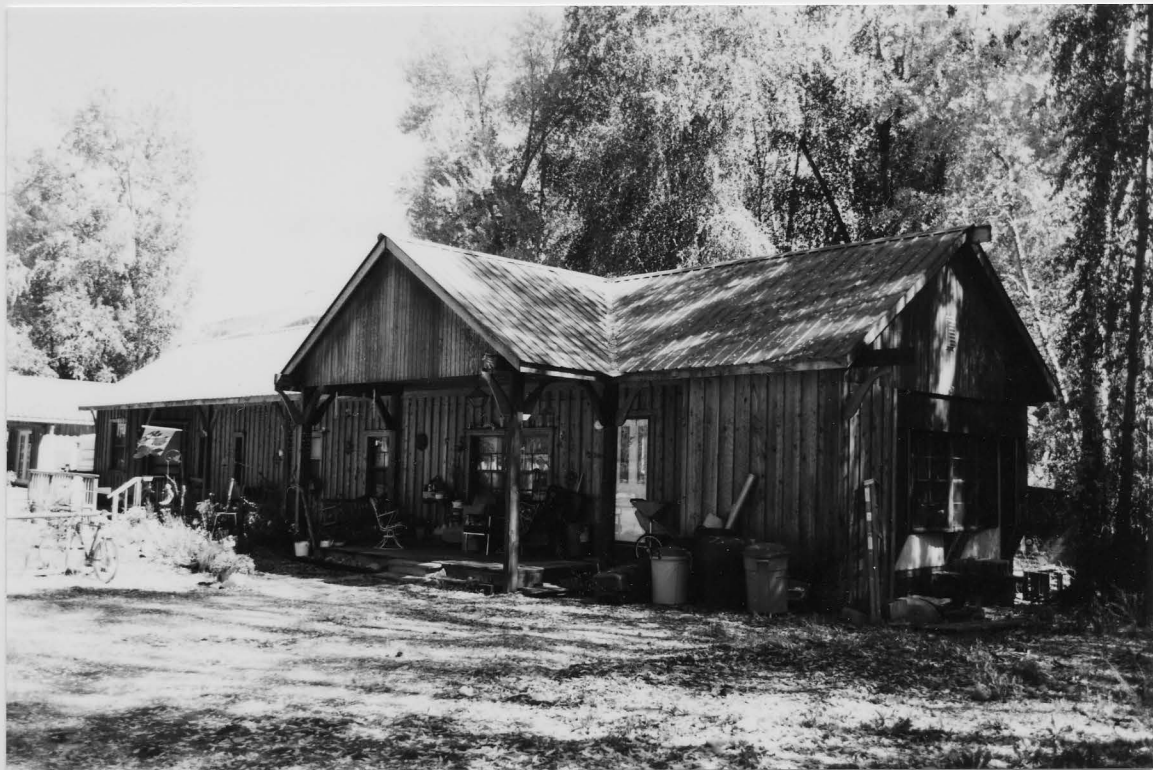
5HN.68.210 220 Henson St. 9/2002