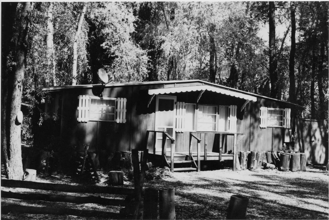
5HN.68.210 224 Henson St. 9/2002