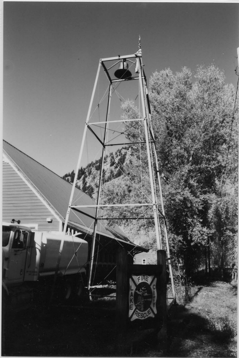
5HN.68.207 Bell Tower 9/2002