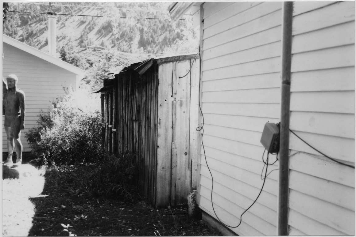
5HN.68.186 Shed 9/2002