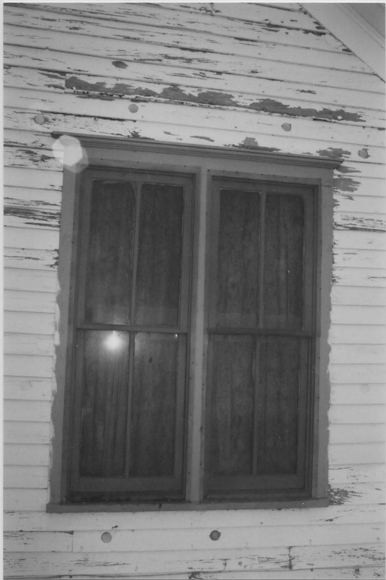
5HN.68.186 Window Detail 9/2002