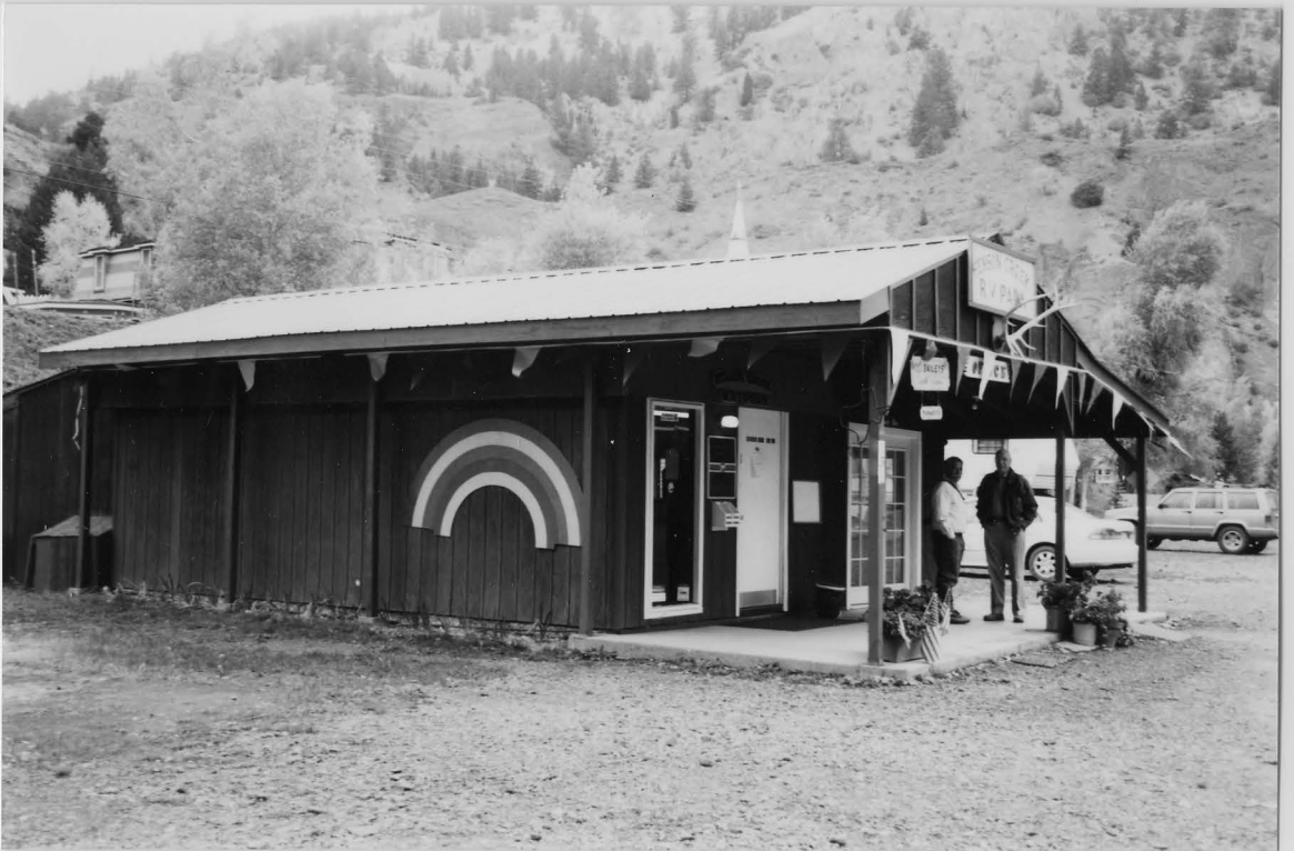
5HN.68.139 office 9/2002