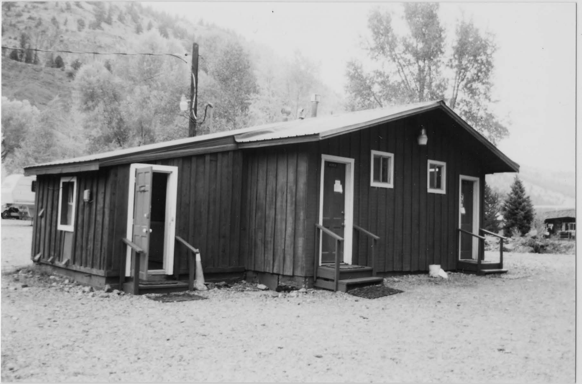
5HN.68.139 Laundromat 9/2002