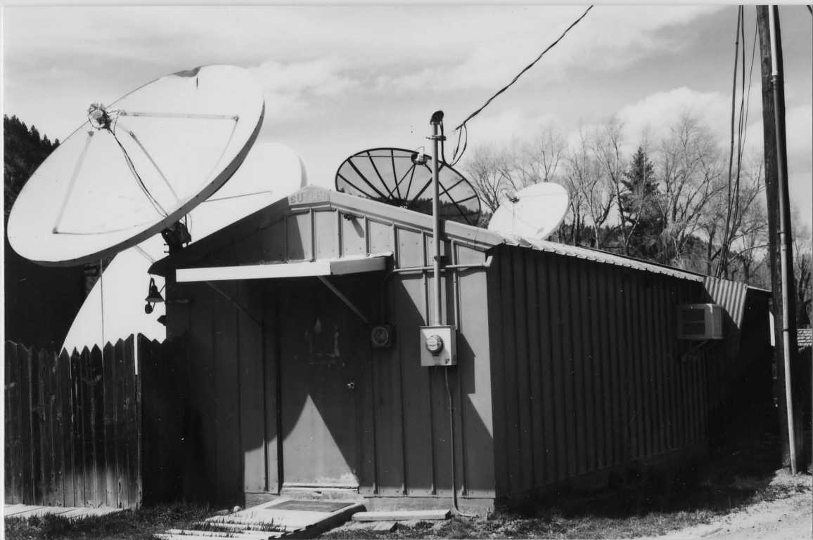
5HN.68.163 Butler Building 3/2003