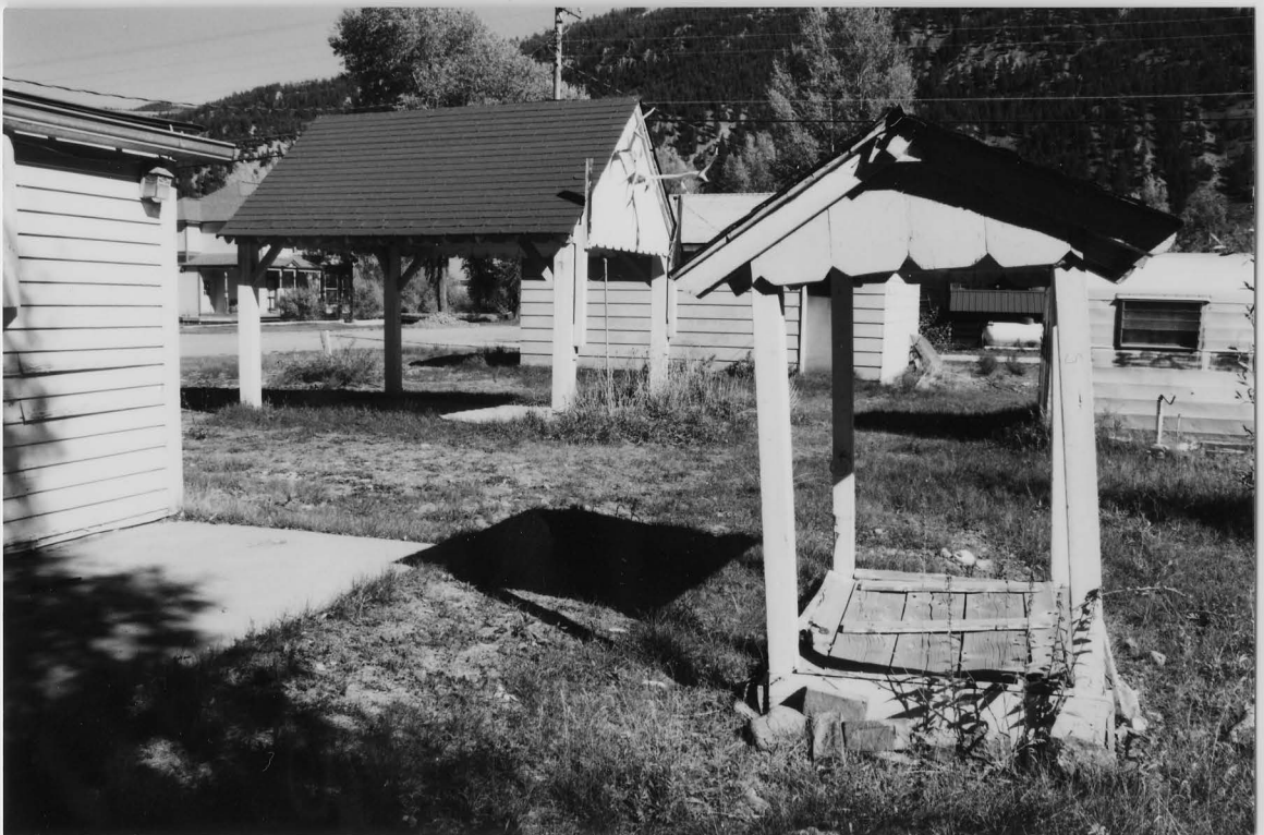
5HN.68.192 Carport & Wellhouse 9/2002