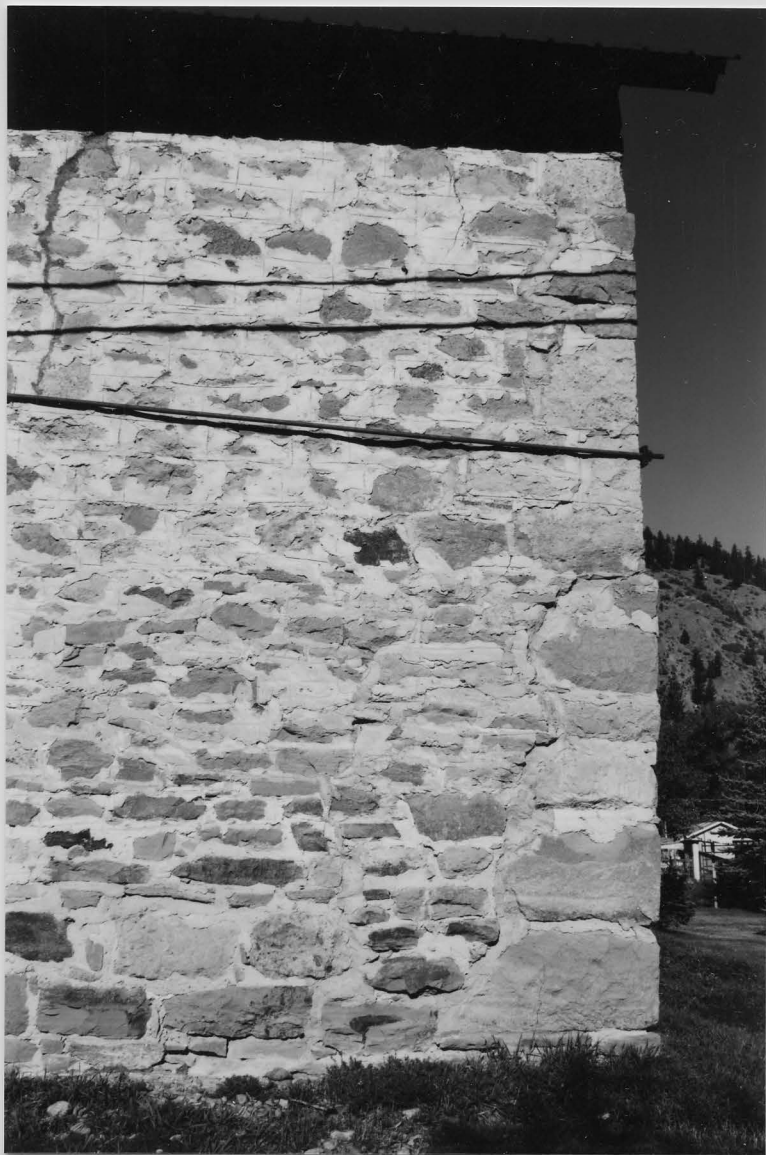
5HN.68.2 Stone Detail 9/2002